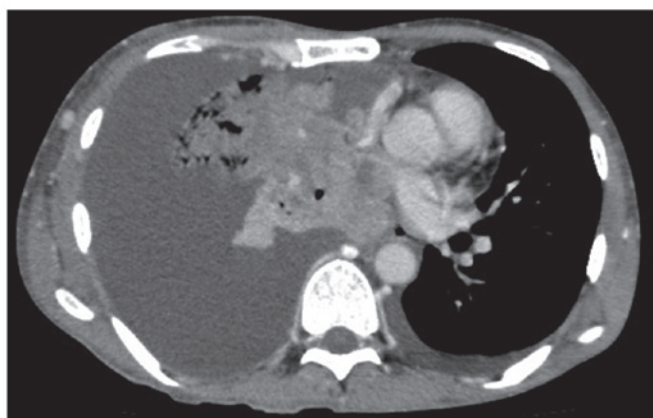
Figure 1. Chest computed tomography (CT) scan showing a large mass with a massive pleural effusion.