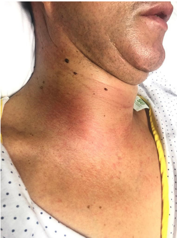
Figure 1. The patient described herein presented with cervical right neck swelling.