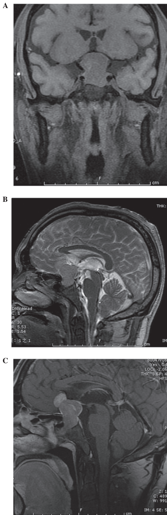
Figure 1. (A) Coronal T1-weighted and (B) sagittal T2-weighted magnetic resonance images showing a well-defined dumbbell shape pituitary mass with compression of the optic chiasm and the third ventricle. (C) the neoplasm is enhanced heterogeneously.