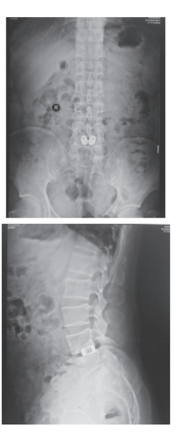
Figure 3. Images captured following bilateral vertebral lamina fenestration for lumbar interbody fusion.

patients are capable of looking after themselves in their daily life although unable to work; poor effects: patients suffer nerve compression and require further surgery. Using these criteria, in our study a total of 42 cases (87.5%) were optimal, 5 cases (10.4%) were good and 1 case (2.0%) was passable. All cases exhibited relieved lower limb pain and the back pain relief rate was 97.9%. One patient demonstrated mild cerebrospinal leakage in the incision 7 days after surgery; this healed well after local processing and the stitches were removed after 3 weeks. One type II case exhibited repeated left waist pain from six months after surgery. The 14 month post-operative X-ray radiographs suggested good interbody fusion; however, the pedicle screw system was loosened and the back pain was relieved following its removal.