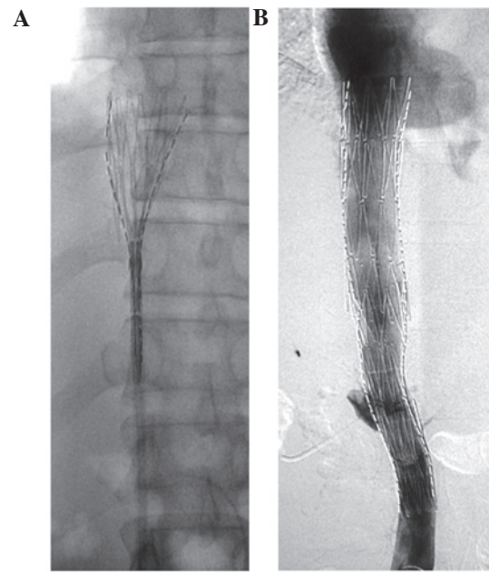
Figure 1. (A) Retreated sheath and 2/3 release of the stent. (B) Completely released stent and opened stenotic segment of the inferior vena cava.