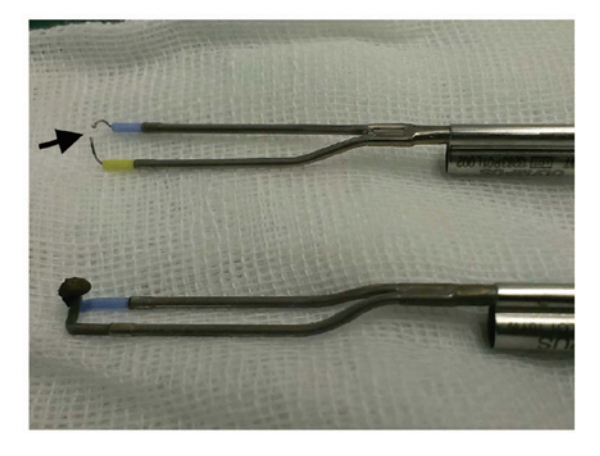
Figure 1. Melted and ruptured electrical loop (arrow) and 'button-type' electrode.