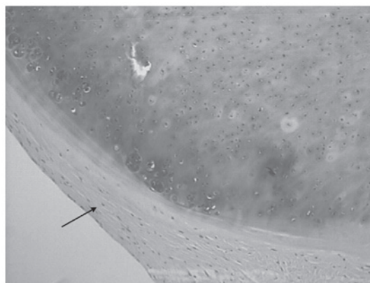
Figure 3. Histopathologic examination of tenosynovial chondromatosis revealed chondrocyte proliferation. Hematoxylin and eosin staining showed that the nodule was covered by a fibrous capsule (black arrow; magnification: x100).

a muscle-like signal intensity on T1-weighted images and exhibit high signal intensity on T2-weighted images (11). In the present case, preoperative ultrasonography revealed