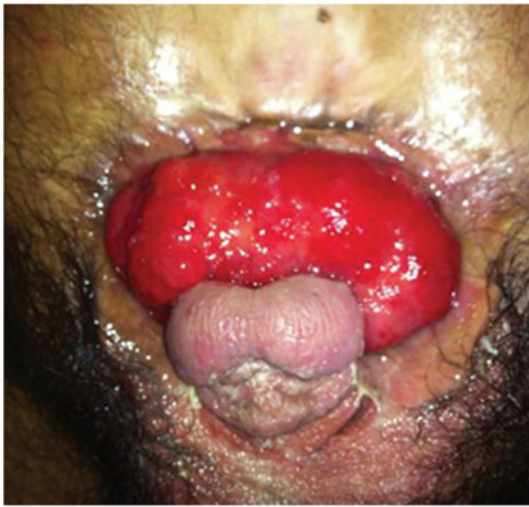
Figure 1. Pre-surgery view of the patient with exstrophy-epispadias complex. Bladder plate showing reddish, broad-based neoplasms.