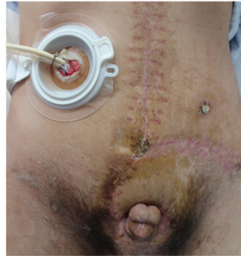
Figure 3. Image at 1 month after surgery. The patient recovered well. Reconstruction of the penis was postponed until following the present surgery.