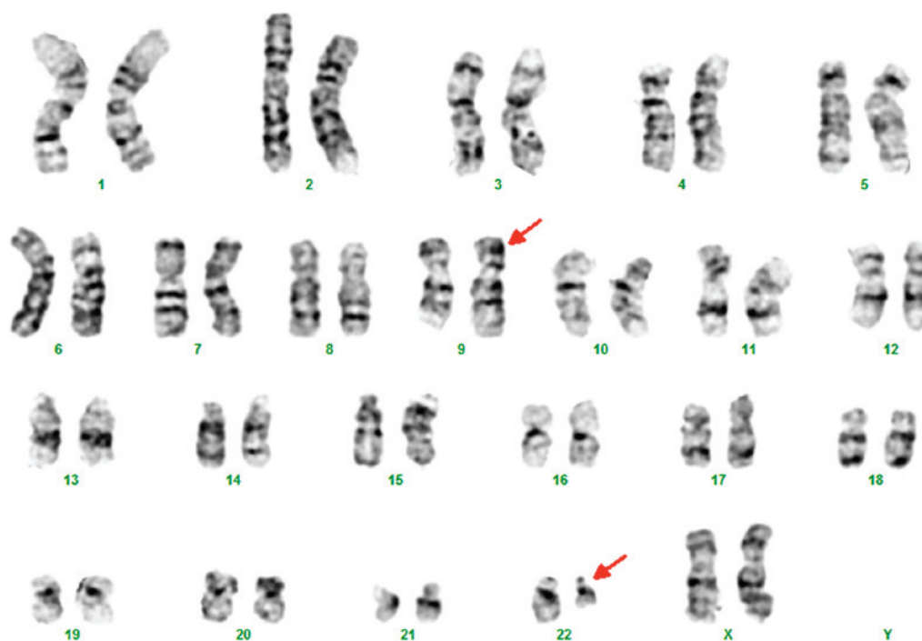
Figure 1. Cytogenetic analysis by G-banding identified 46,XX,t(9;22)(q34;q11.2).