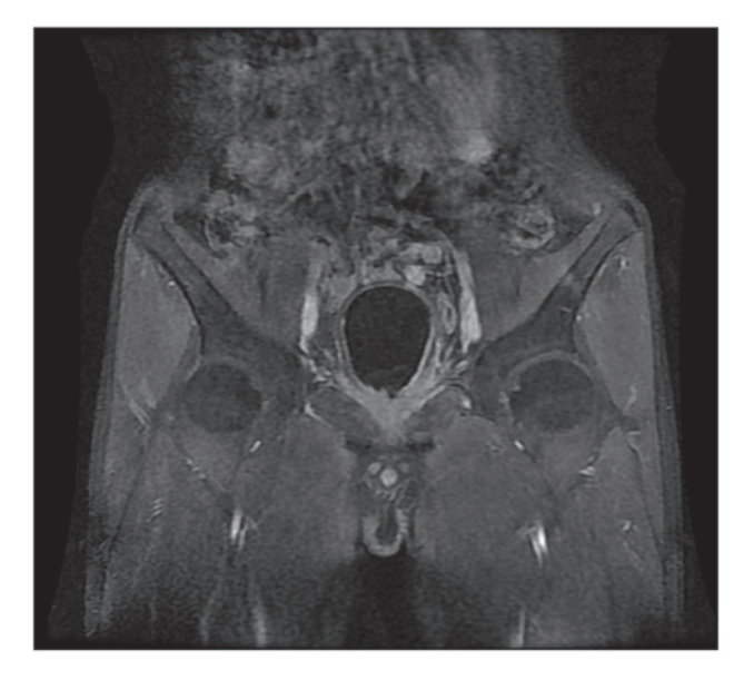
Figure 2. Magnetic resonance imaging (MRI) following radiotherapy. An enhanced MRI revealed that the size of the lesion in the prostate and bladder had decreased to 30x25x29 mm following radiotherapy. The boundary of the lesion was still unclear and the lesion exhibited inhomogeneous enhancement.

pheochromocytoma with invasion of the prostate, indicating that the tumor was malignant.