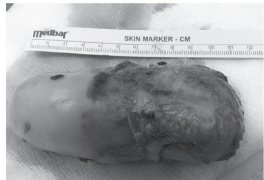
Figure 2. Macroscopic specimen of the appendiceal mucocoele including the base of the appendix.