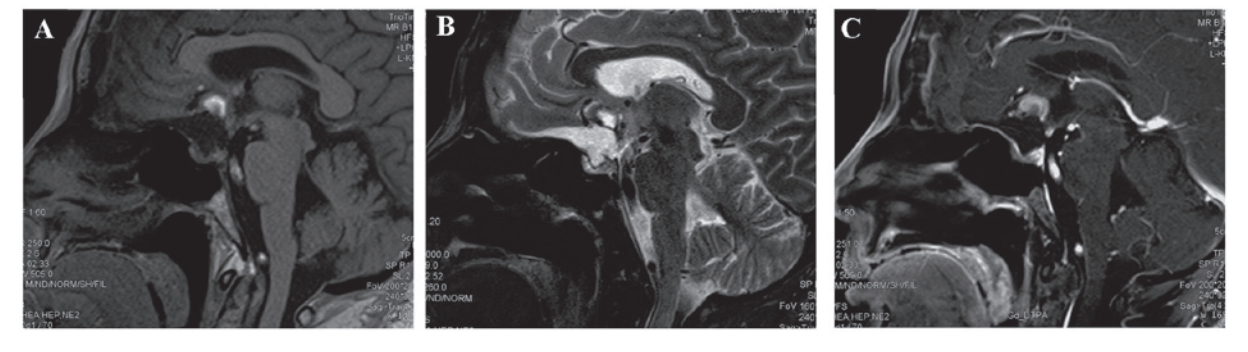
Figure 3. Postoperative magnetic resonance imaging confirmed partial tumor resection. The residual tumor above the optic chiasma exhibited (A) heterogeneous isointensity on a representative T1-weighted image and (B) heterogeneous hyperintensity on a representative T2-weighted image, with (C) significant contrast enhancement.

xanthogranulomas associated with pituitary adenoma. They identified 5 patients (2.2%) with a remarkable xanthogranulomatous reaction among 231 consecutive cases of pituitary adenoma, and all 5 patients exhibited anterior pituitary insufficiencies (1). However, in the present case, the patient only presented with headache, vomiting and mild visual impairment, whereas there was no endocrine dysfunction or hypopituitarism. Thus, there may be no detectable connection between endocrine dysfunction and the size or extension of a pituitary adenoma. Sporadic cases have also manifested as obstructive hydrocephalus with acute changes in consciousness (19).