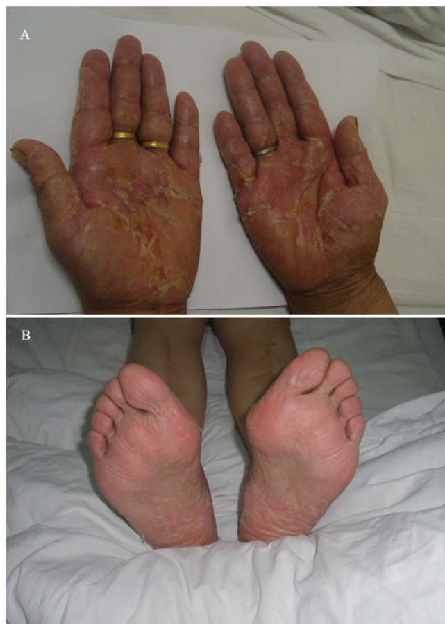
Figure 2. Acral erythema and desquamation on both (A) palms and (B) soles. The symptoms were more severe on the palms.