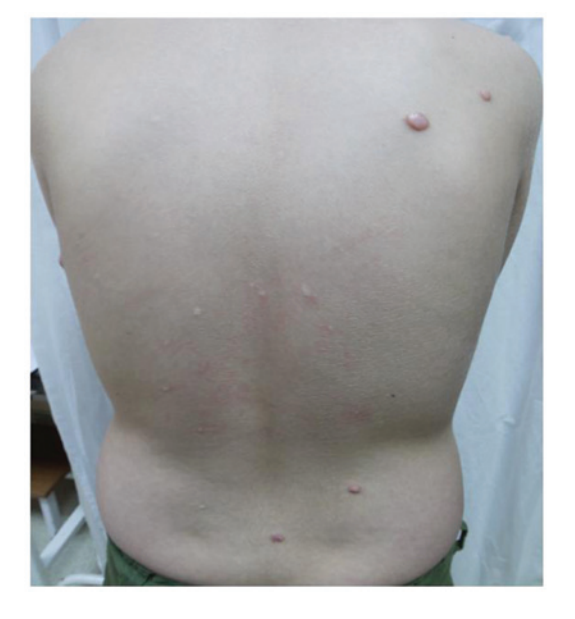
Figure 1. Multiple, firm, red-brown masses in the left scapular region.