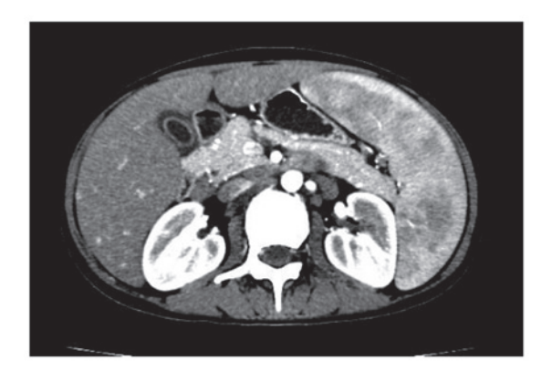
Figure 2. Abdominal computed tomography (CT) scan of the patient with Felty's syndrome (FS).

surrounding hepatic hilar was shown by abdominal computed tomography (CT) (Fig. 2). A lymph node biopsy from the right cervical node revealed chronic inflammation, with positive results for cluster of differentiation (CD)79 \alpha and CD20 in interfollicular regions, and for CD5 in the paracortical area (Fig. 3). Fluorodeoxyglucose (FDG)-positron emission tomography revealed lymphadenectasis of the bilateral submandibular and superficial anterior cervical lymph node, axillary fossa, retroperitoneal space, pelvic wall and inguinal area without FDG uptake. The proliferation of hypermetabolic lesions was observed in the shoulder, hip, knee, ankle and interphalangeal joints, as well as knee joint-effusion, which was the manifestation of RA. FDG uptake in the liver and spleen occurred with a maximal standardized uptake value of 1.4 and 2.0, respectively. The pathological evaluation of liver tissue showed inflammatory infiltration containing swelling and spotty or fragmented necrosis in the hepatocytes (Fig. 4). Based on these findings, the provisional diagnosis was of FS.