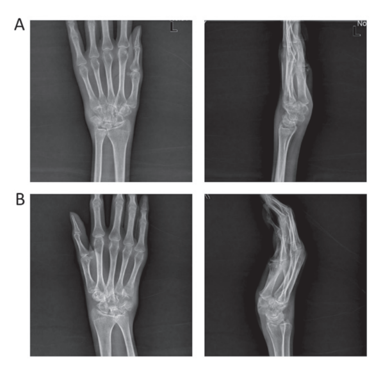
Figure 1. Joint X-rays of (A) left and (B) right wrists.