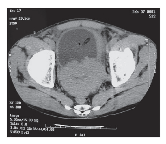
Figure 1. Computed tomography scan showing a large prostate tumor, 9 cm in diameter.