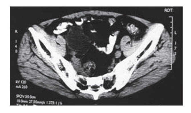
Figure 4. Computed tomography scan showing a decrease in tumor size following cyclophosphamide chemotherapy.