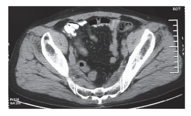
Figure 5. Computed tomography scan showing no recurrence or metastasis of the tumor.

The patient was readmitted to the hospital after 6 months to consolidate the efficacy of intravenous chemotherapy. The initial and consolidation chemotherapy regimens both consisted of 9 cycles of 400 mg cyclophosphamide plus 500 ml normal saline, together with an intravenous glucose tolerance test, once a day, for 1 week. In June 2003, 2 years after the surgery, the pelvic CT scan showed a pelvic mass suggestive of the metastasis (Fig. 3). The lactate dehydrogenase (LDH) tumor marker level (745 IU/l; normal range, 100-300 IU/l) was significantly increased, the total PSA (tPSA) and free PSA (fPSA) levels were normal, and the \beta -human chorionic gonadotropin ( \beta -HCG; 4.54 ng/ml) level was mildly raised.