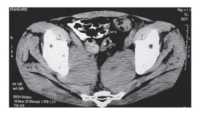
Figure 3. Computed tomography scan showing a pelvic mass suggestive of the metastasis 2 years after the surgery.

1-2 nucleoli with rich cytoplasm and stromal lymphocyte infiltration was evident. The tumor involved the wall of the bladder, while the rectal wall and the left ureteral stump were not involved. The lymph nodes of the right and front left iliac vessels and seminal vesicles were involved. Following the removal of the testicles, the pathology report indicated that no tumor cells were present in the testicles, and no evident disorders were identified in the lungs and abdominal organs according to the imaging studies. Therefore, the patient was diagnosed with primary prostate seminoma.