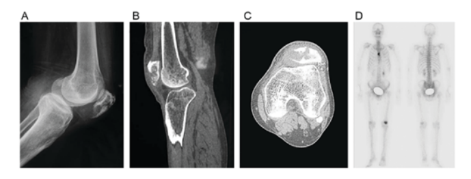
Figure 1. The imaging features of patellar metastases from lung carcinoma. (A) Radiograph and (B) computed tomography (CT) scan on the left patella revealed an osteolytic lesion. (C) Axial CT identified soft tissue swelling surrounded the lesion. Additionally, a [99mTc]methylene diphosphate bone scintigraphy (D) indicated increased radioactivity in the pulmonary hilum and the left patella.

A patellectomy was performed followed by routine physiotherapy. Radiotherapy was used to target the internal mammary and mediastinum, with Prednisone supplemented. The knee pain was relieved and effusion was gradually aspirated. The general condition of 1 case deteriorated rapidly and the patient succumbed following a short period of time (31).