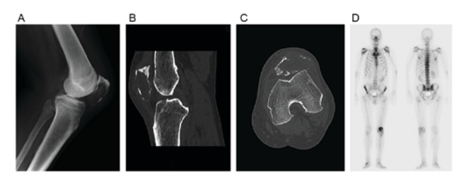
Figure 2. The imaging features of patellar metastases from renal carcinoma. (A) Lateral radiograph and a (B) sagittal and (C) transverse computed tomography scan of the affected patella indicated a large lucency within the patella and a discontinuity in the anterior cortex of the inferior pole suggesting pathological fracture. (D) A bone scan demonstrated an isolated abnormal tracer activity local to the left patella.