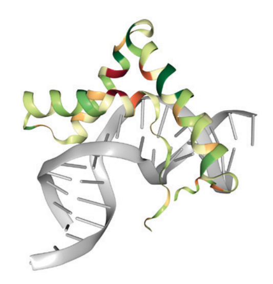
Figure 1. Protein structure and DNA-binding of SOX18. SOX18, SRY-related HMG-box 18 (58).

The representatives of the group F of SOX proteins are the proteins SOX7, SOX17 and SOX18, jointly involved in the development of the cardiovascular and lymphatic systems during the embryogenesis process (27,28). Since the main characteristic of these proteins is their high homology, they are able to take over each other's functions, as demonstrated in a mouse model where the inhibition of the SOX18 gene expression resulted in an increased expression of the SOX7 and SOX17 gene (29).