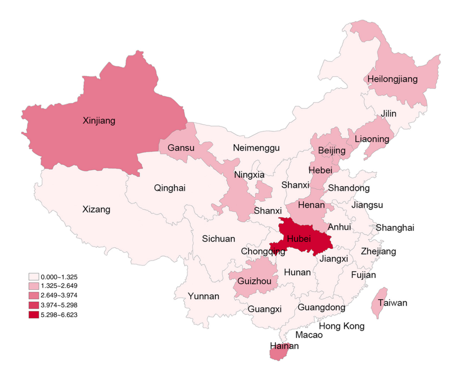
Figure 2. Fatality rate of COVID-19 in Chinese provinces on May 2, 2020. The numbers next to the color key indicate the fatality rate ranges.

with COVID-19 (26). Negative emotions and psychological diseases may not only delay recovery, but also pose challenges to treatment due to the possibility of extreme behaviors, such as non-cooperation during treatment (5). Psychotherapy and music therapy may help patients to remain calm and may enhance their confidence in overcoming the disease (27).