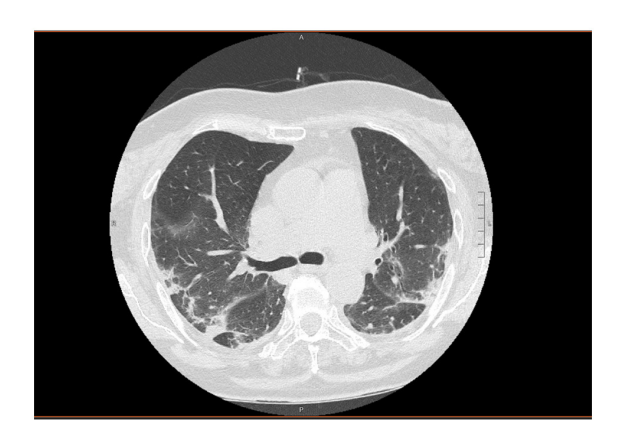
Figure 4. Thoracic CT scan of case 4. A, anterior; P, posterior; R, right; L, left.

response, culminating in ARDS, which is also determined by the up- and downregulation of the expression of several genes directly stimulated by SARS-CoV-2 infection (15).