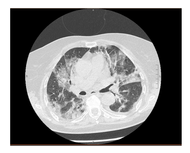
Figure 3. Thoracic CT scan of case 3. A, anterior; P, posterior; R, right; L, left.

nirmatrelvir/ritonavir) or monoclonal antibodies (sotrovimab), administering these within the correct time lapse. However, the second phase (inflammatory phase) is more severe, and thus it is difficult to treat due to its severity, complexity and lack of standardized treatments (14).